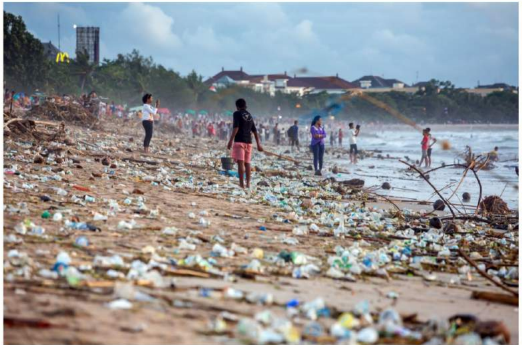
Beach pollution at Kuta beach, Bali.