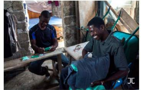
Prospective employees at a Thread-affiliated recycling facility are shown products made with the recycled materials, Haiti, 2014.