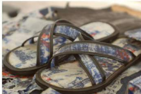
Many things can be made from these, including shoes and bags.