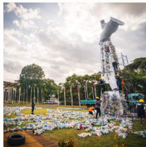
Plastic waste turned into an installation outside the UN assembly in Nairobi, 2022. #TurnOffThePlasticTap

On March 2, 2022, "in a historic move to deal with the global problem of plastic waste, 175 nations across the world adopted a historic resolution at the fifth United Nations Environment Assembly (UNEA) in Nairobi to forge an international 'legally binding agreement' by 2024 to end plastic pollution. The landmark resolution addresses the full lifecycle of plastic, including its production, design and disposal." [79] In a joint statement, U.S. Senators Bob Menendez (D-NJ), Dan Sullivan (R-Alaska), and Sheldon Whitehouse (D-RI), commented: "We are very pleased to see this major step forward in the global fight against the marine debris crisis and look forward to collaborating with partner countries to reach a final agreement. ... We are committed to doing our part to enhance global cooperation so the United States is part of the solution to mitigate plastic pollution and its harm to marine life." [80]