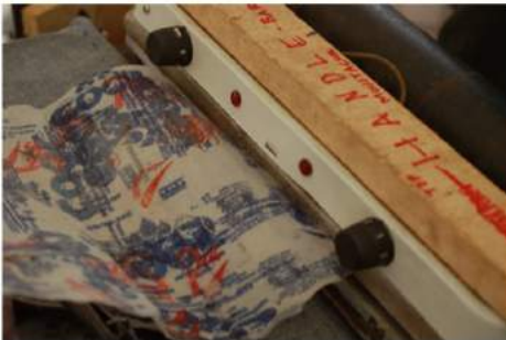
The plastic recycling press used to create plastic sheets.